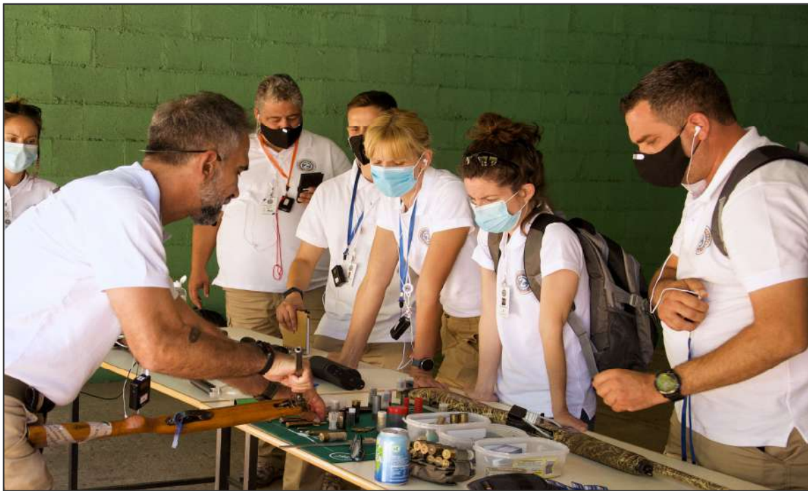
Photo 4. Practical training session of Level I training module about the use of firearms and poaching.