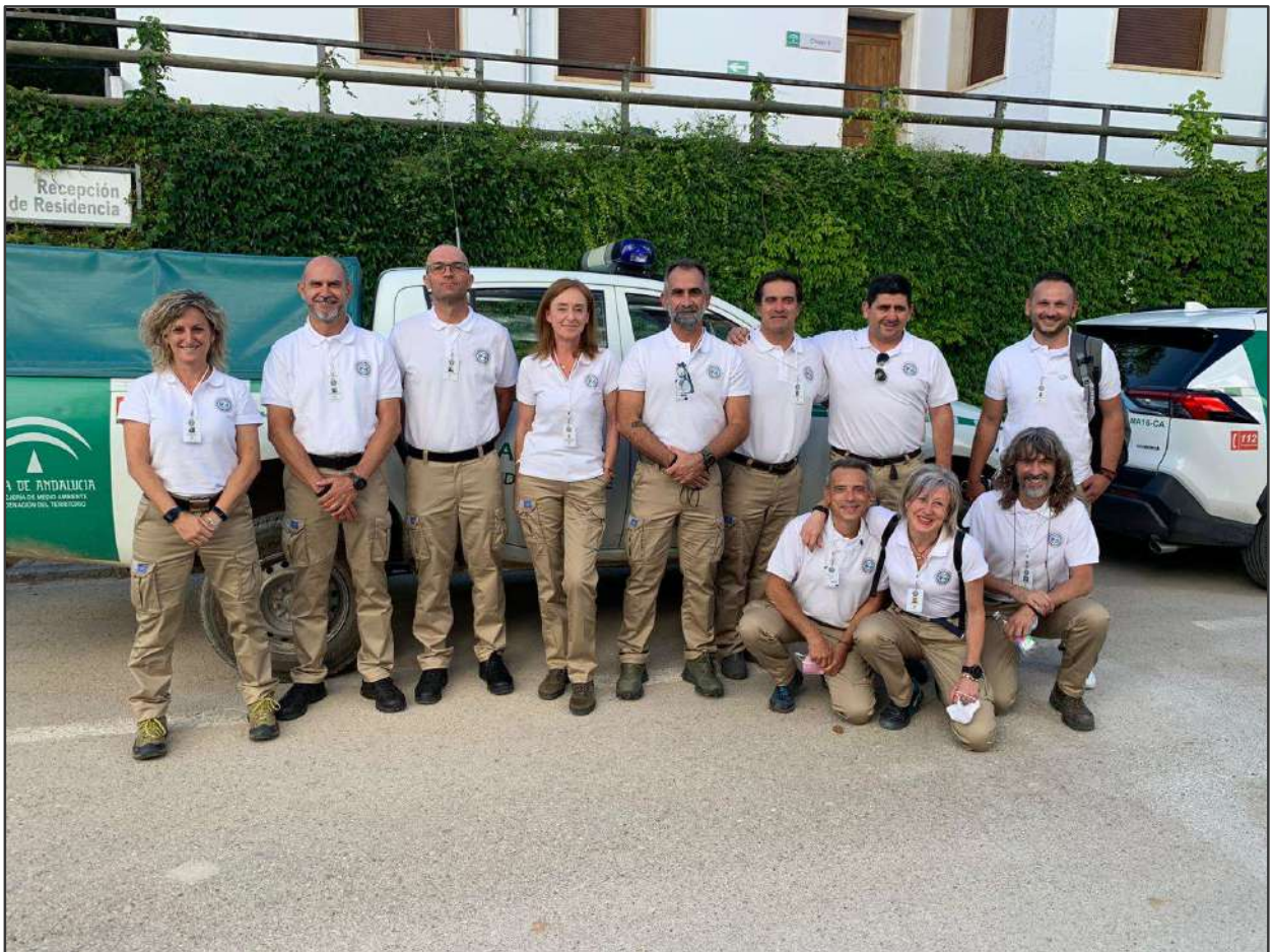
Photo 1. Core professorial team of the Wildlife Crime Academy

The core professorial team of the Wildlife Crime Academy is comprised of experienced staff from the environmental service of the Junta de Andalucía and VCF, while several teaching modules include participation of other relevant authorities for combating wildlife crime, such as Guardia Civil (SEPRONA), Ministerio para la Transición Ecológica y el Reto Demográfico (MITECO) and Europol.