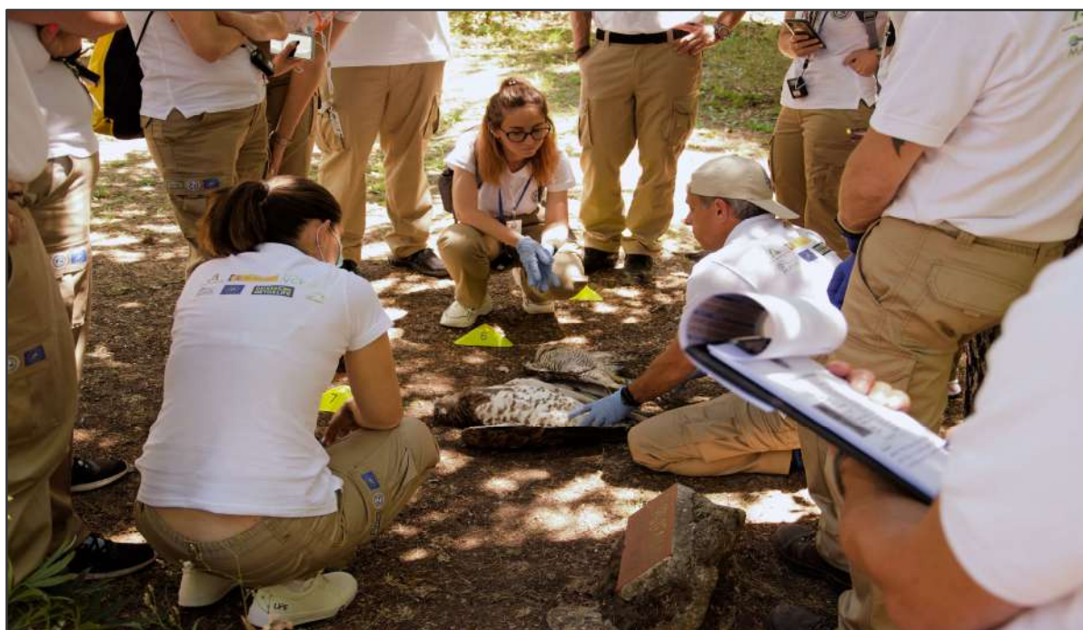
Photo 3. Practical training session of Level I training module about body posture of dead wild animals