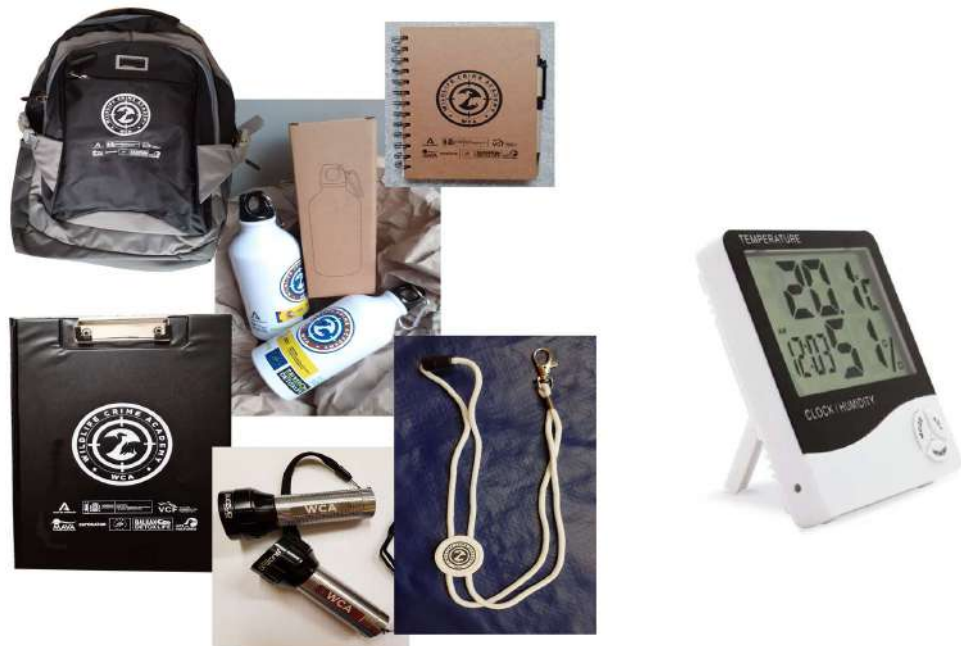
Photo 19. Field kit for WCA participants.