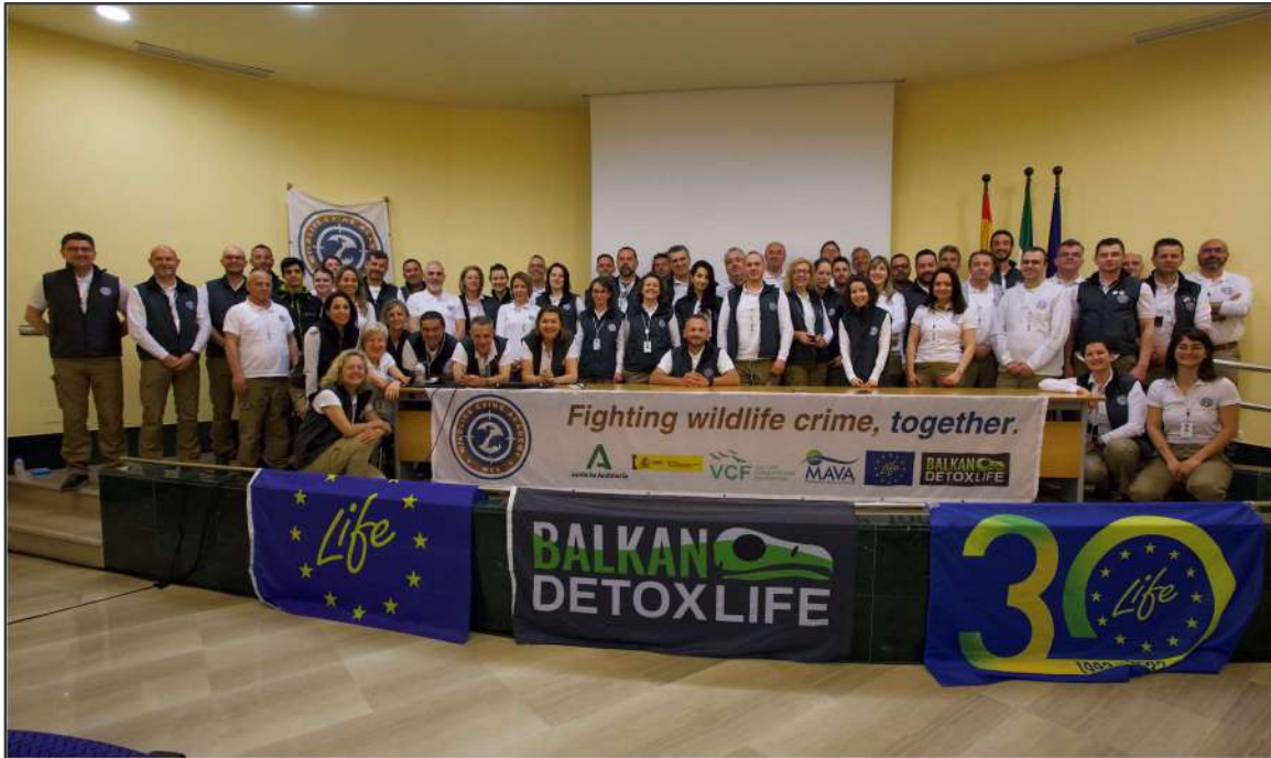
Photo 14. Final training cohort of the Wildlife Crime Academy