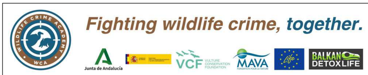
Photo 16. Banner 1 of the Wildlife Crime Academy.