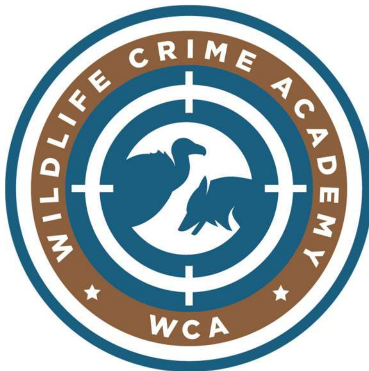
Photo 15. Wildlife Crime Academy logo.