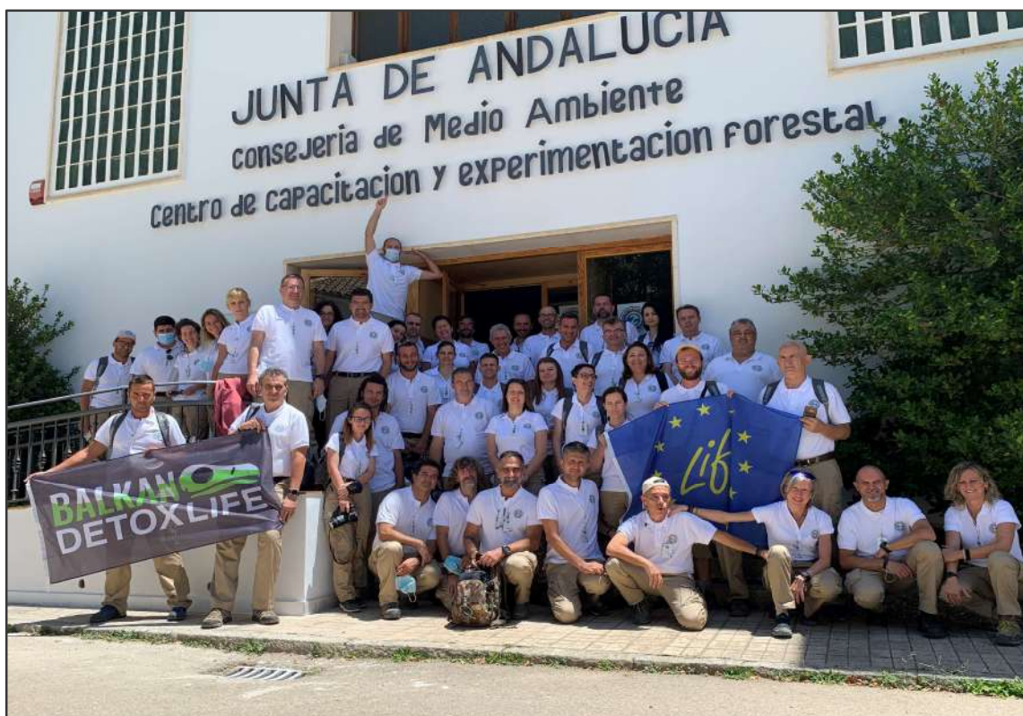
Photo 12. First training cohort of the Wildlife Crime Academy