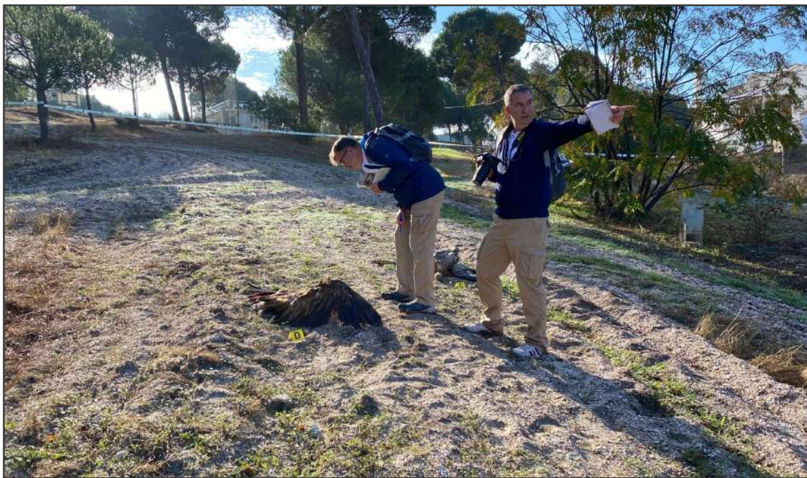
Photo 9. Final practical exam of Level 2 training course