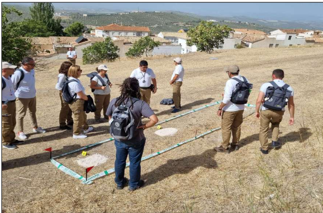
Photo 7. Practical training session of Level 2 training module about investigative procedures in the field.