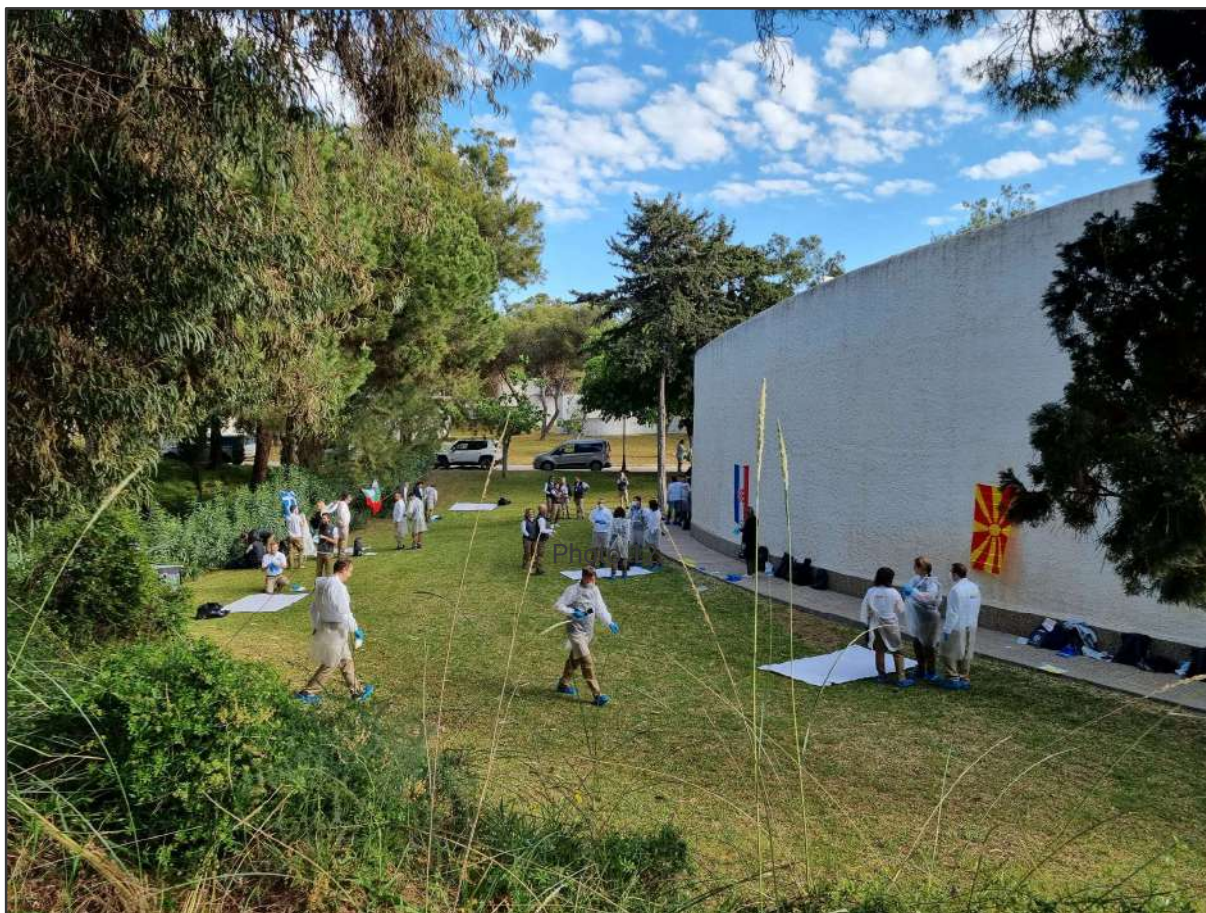
Practical training session of Level 3 training module about collecting trash intelligence.