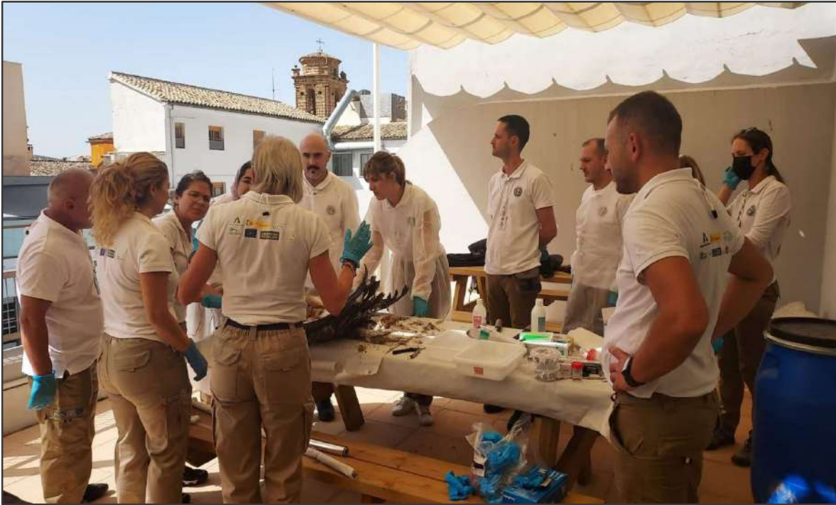
Photo 8. Practical training session of Level 2 training module about forensic veterinary examination and sampling for toxicology