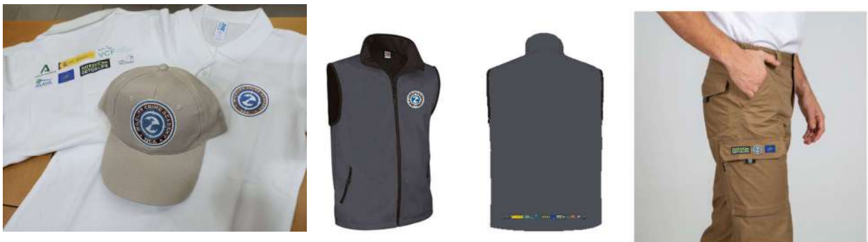
Photo 18. WCA uniform

Participants were also provided with basic safety equipment (masks, nitrile gloves, protective suits) and a field kit (water bottle, folder, notebook, pen, field forms, evidence markers, torch, temperature and humidity measures) in order to effectively participate in the practical workshops.