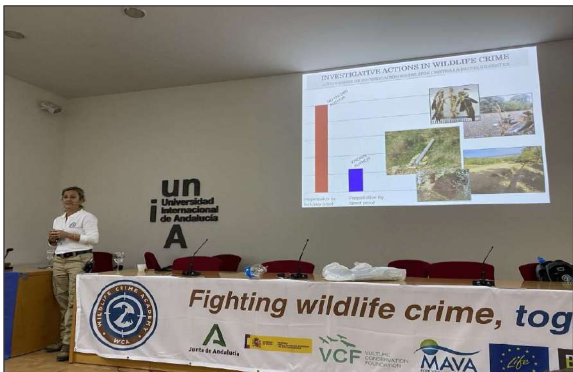
Photo 6. Theory classes of the Level 2 training module.