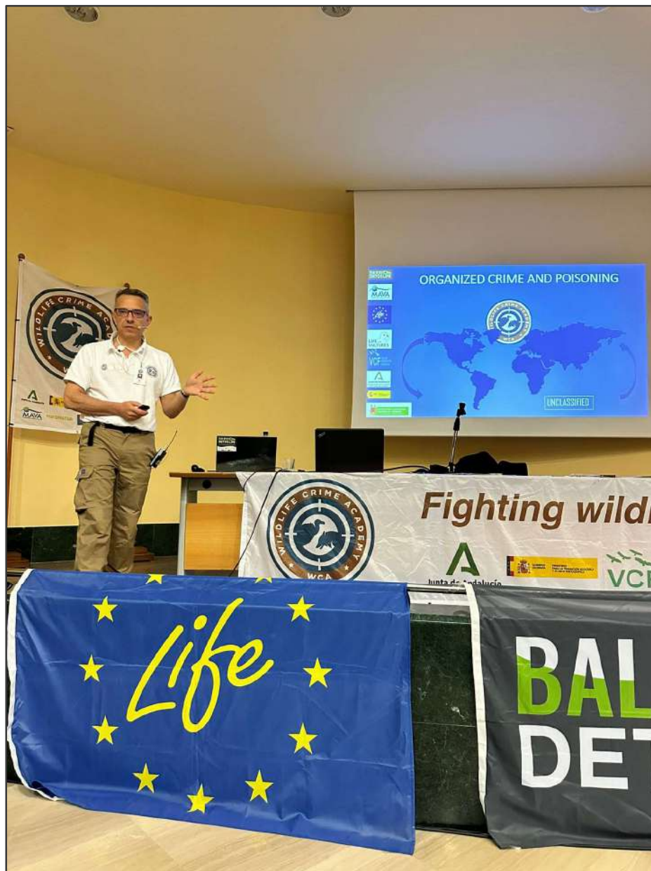
Photo 10. Theory classes of the Level 3 training module.