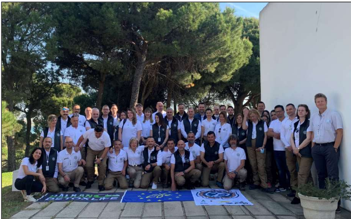
Photo 13. Second training cohort of the Wildlife Crime Academy

Again, the representatives of relevant governmental institutions for combating wildlife poisoning comprised the majority (84%) of participants of the second training Cohort.