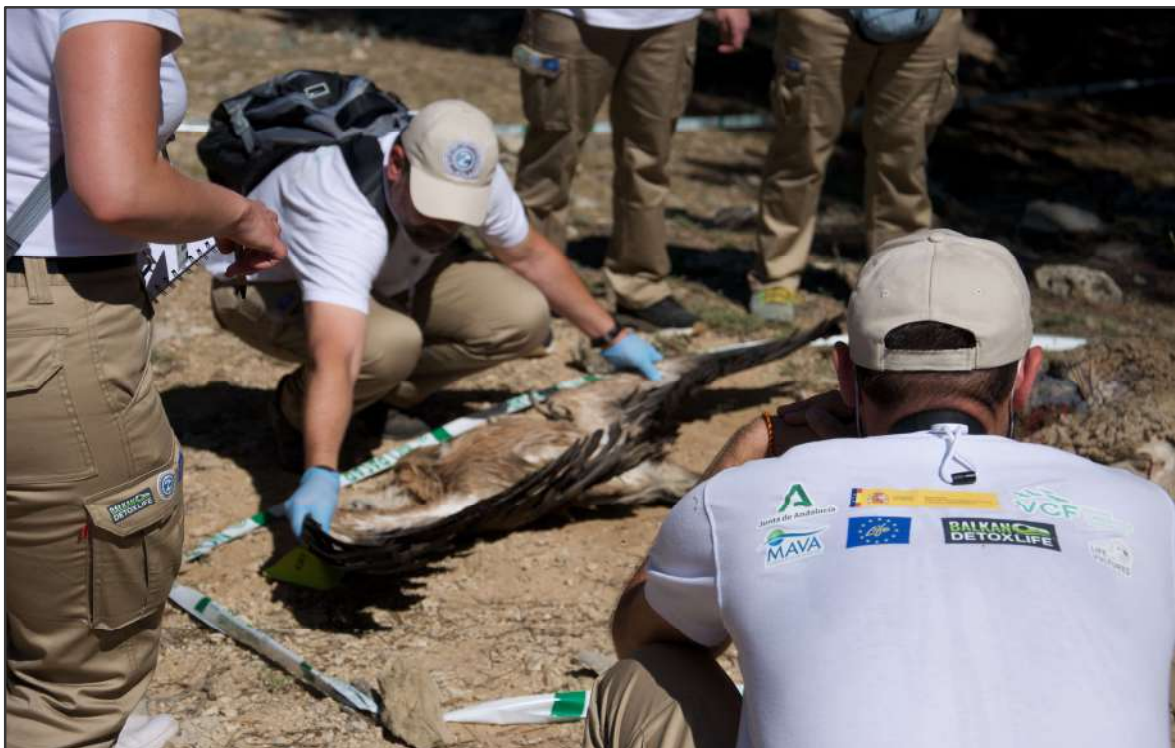
Photo 5. Final practical exam of Level 1 training course