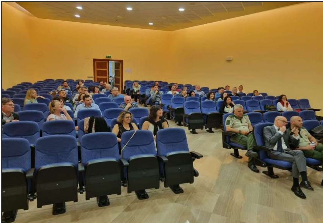
Photo 9. Theory classes of the Level 3 training module.