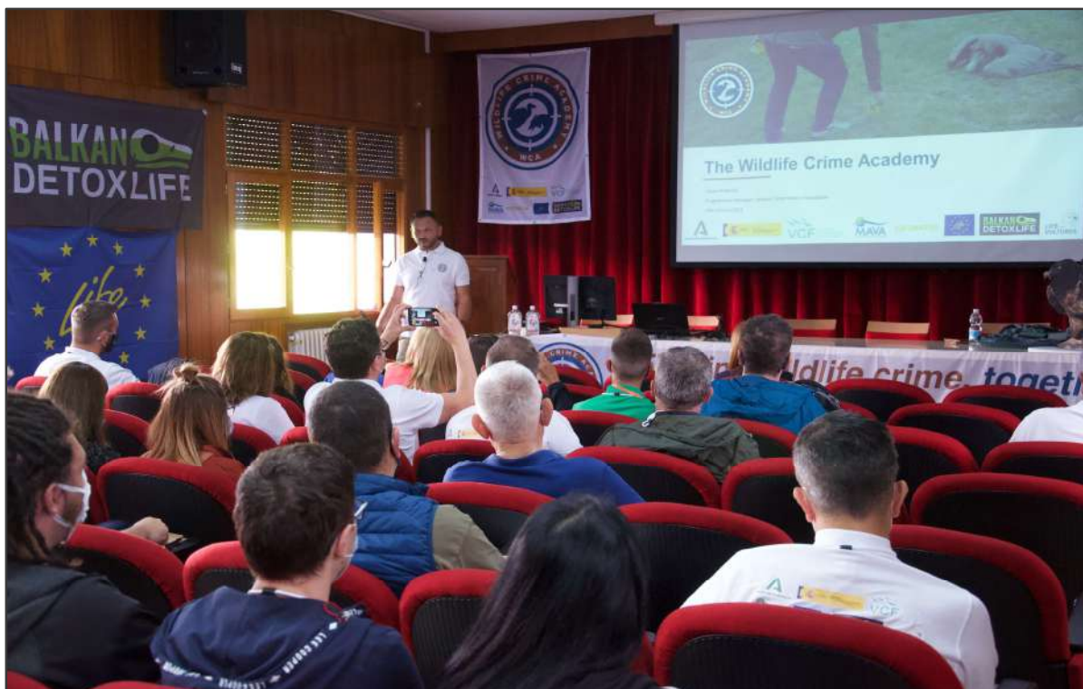
Photo 2. Theory classes of the Level 1 training module