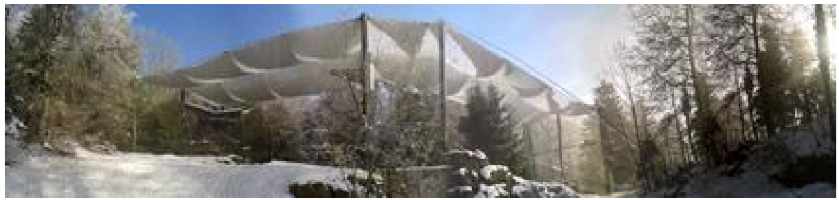
Tierpark Goldau breeding Unit.

Summary 18 breeding pairs in the specialized captive breeding centers laid 29 eggs. 13 offspring were successfully reared, 7 males and 6 females, while 4 hatchlings died.