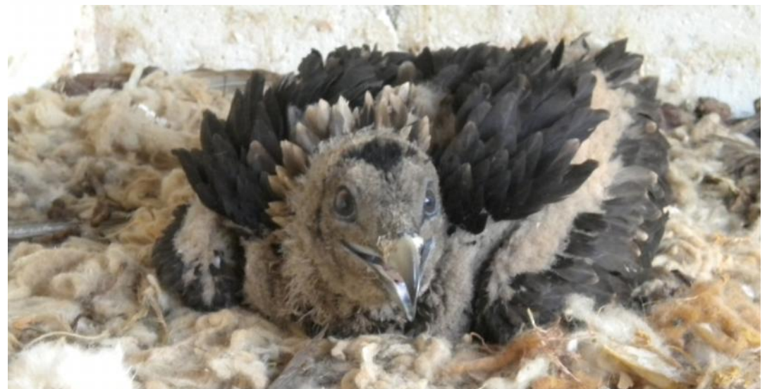
BG 751 with 49 days old and a weight of 3629 g. He has been successfully reared by imprinted male BG 217.

• Breeding center Asters (Conservatoire d'Espaces Naturels Haute Savoie)