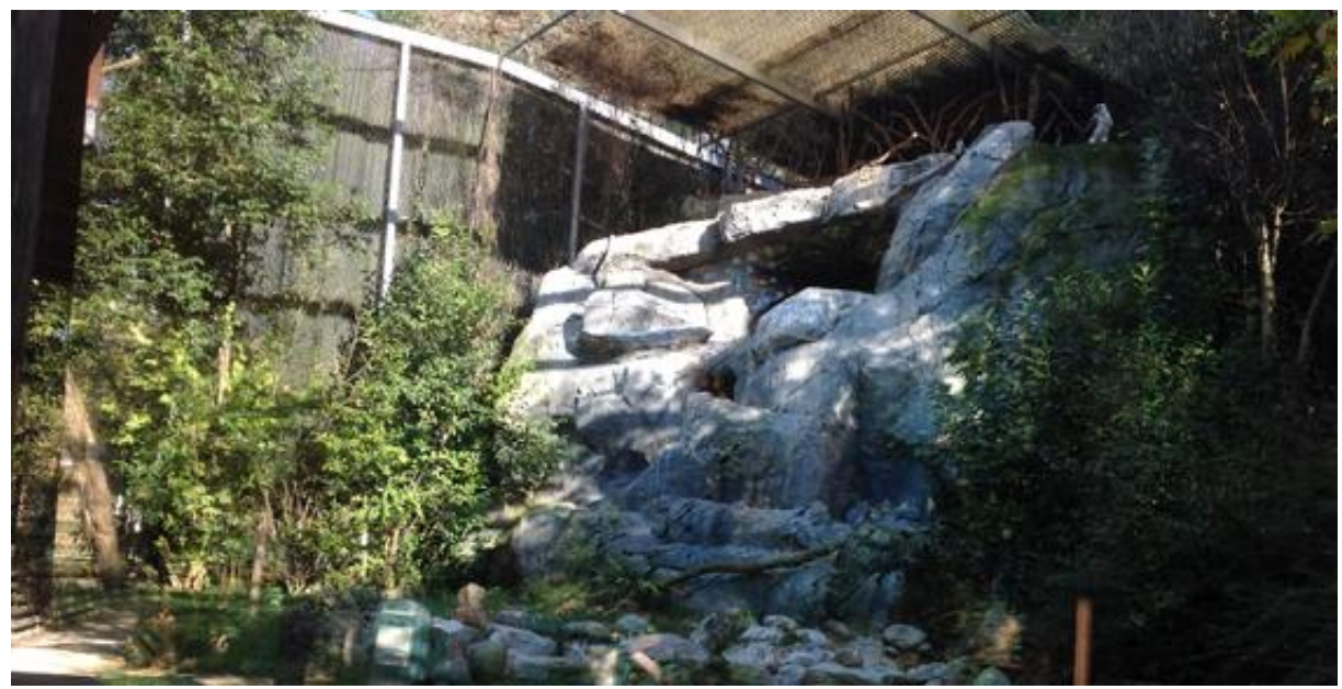
Bearded Vulture aviary, Parco Natura Viva, Italy

During autumn 2013 two zoos have already use this new service (Zoo Parco Natura Viva, Italy, and Natur und Tierpark Goldau, Switzerland).