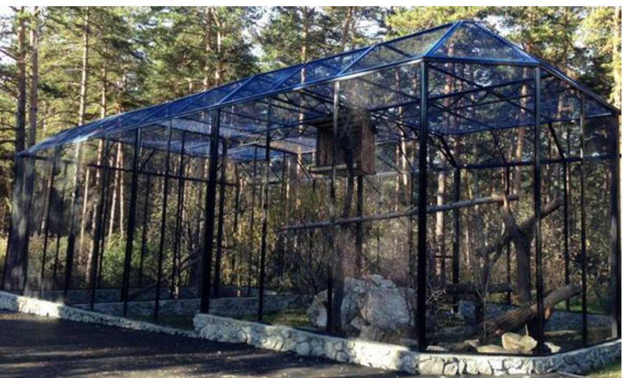
The Novosibirsk Zoo reconstructed an aviary, adapting it for its Bearded Vulture.

During 2013 we lost 7 birds (4 males and 3 females).