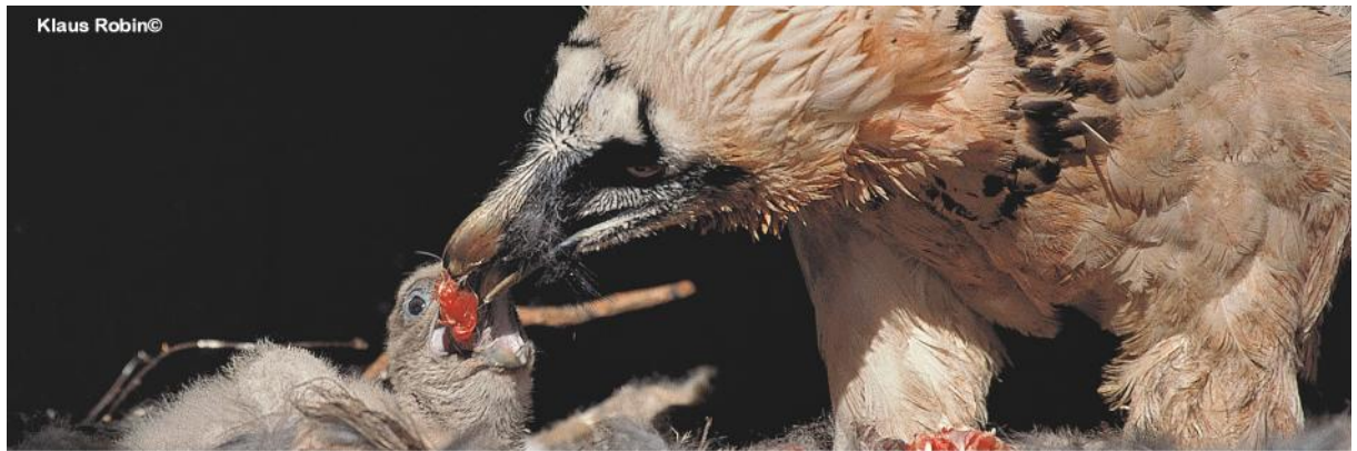
The final aim of the Bearded Vulture EEP is to produce chicks suitable for release, capable to survive in the wild without human help and able to reproduce when they arrive to their sexual maturity. Only natural reared chicks fulfill this aim.