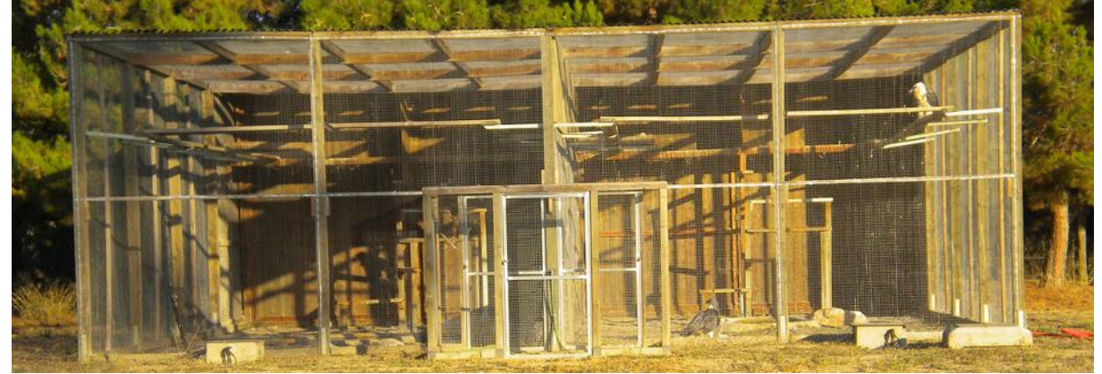
The very successful specialized breeding center in Vallcallent was at risk of closing down due to the economic crisis in Spain.

• New advisory service offered by the VCF-EEP coordination