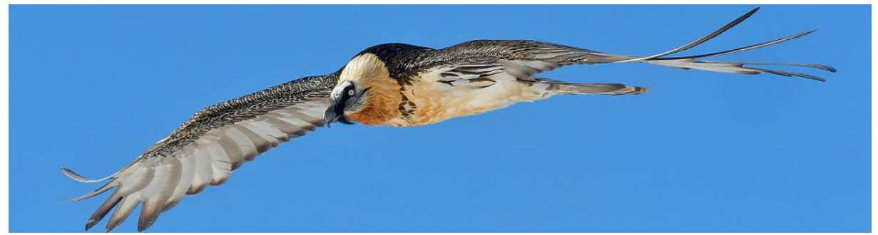
Thanks to the good cooperation in the Bearded Vulture EEP, the goal to re-establish an European metapopulation is getting closer.

how to avoid disturbances from neighbor species, suggesting better nest location, nest building, detection of dangerous structures in the cage, etc.), and also husbandry recommendations (e.g. avoid entering the cage while putting food, how to give nest material, etc.).