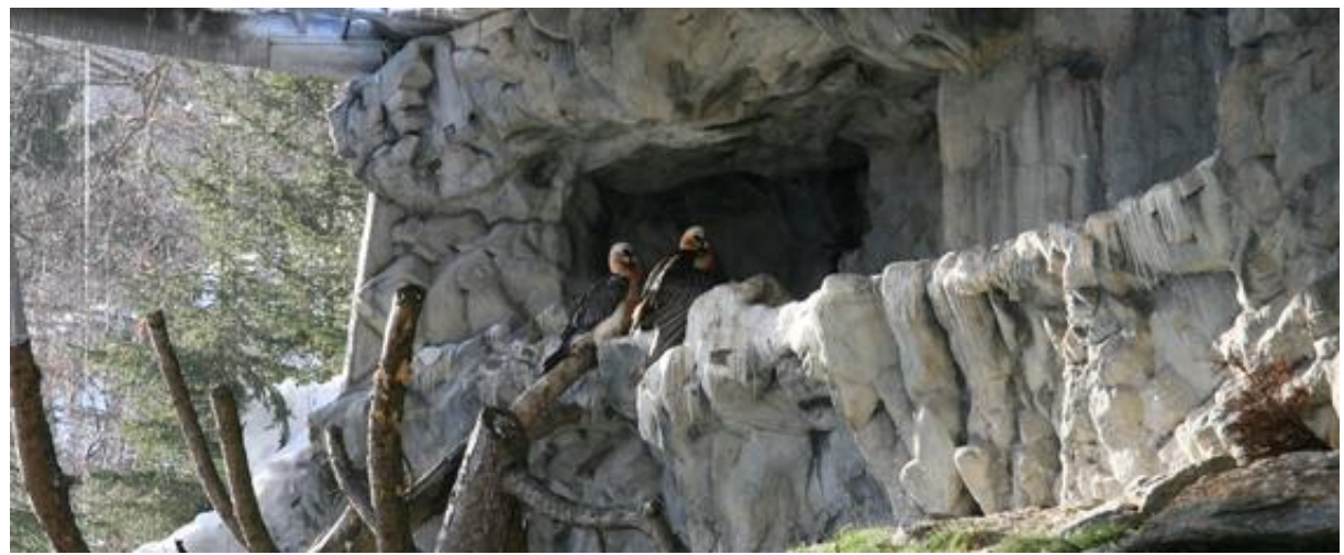
The famous Alpenzoo Innsbruck breeding pair in their aviary. Many thanks for your inspiration and contribution over the years!