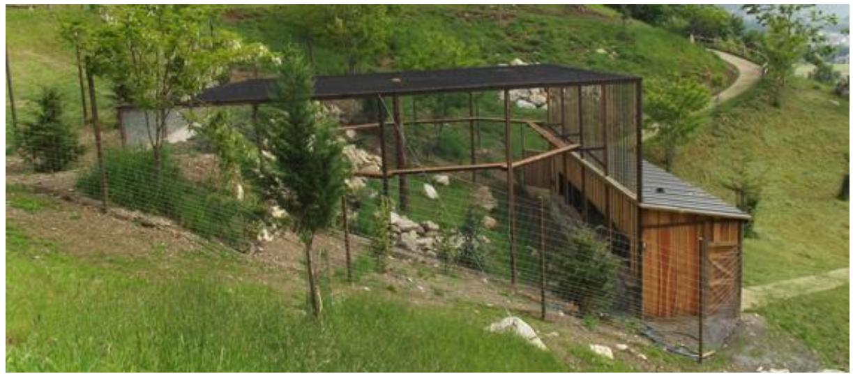
Parc Animalier des Pyrénées has built a completely new Bearded Vulture aviary.

From the 17 available chicks (2 were hand-reared and thus excluded), 4 were added into in the EEP network: 3 males and one female. The female was kept in the captive network because she was attacked as nestling by a genet and lost her left eye. Fortunately she is a descendent from a rare founder line (Pyrenean). This female has been transferred to the new partner Parc Animalier des Pyrénées. Additionally one adult injured wild male from Novosibirsk Zoo has been included in the EEP.