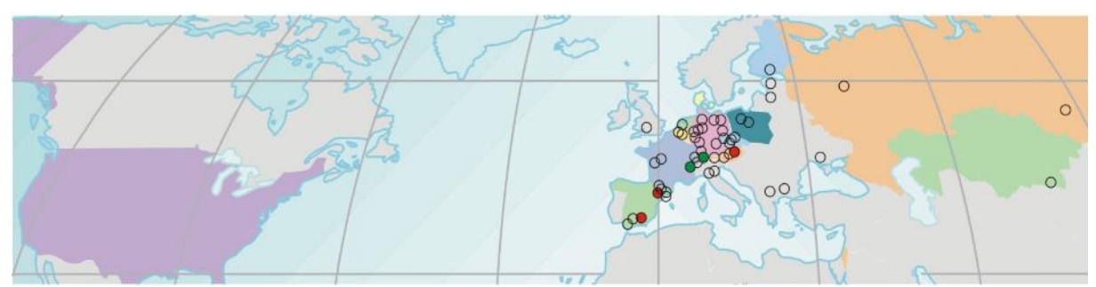
The distribution of the captive stock over many Zoos lowers bulk risks, e.g. epidemic diseases.

In 2013 the EEP included 36 (mainly European) zoos, 3 large (red spots) and 2 smaller (green spots) specialized captive breeding centers, and 3 private keepers, keeping a total of 161 birds.