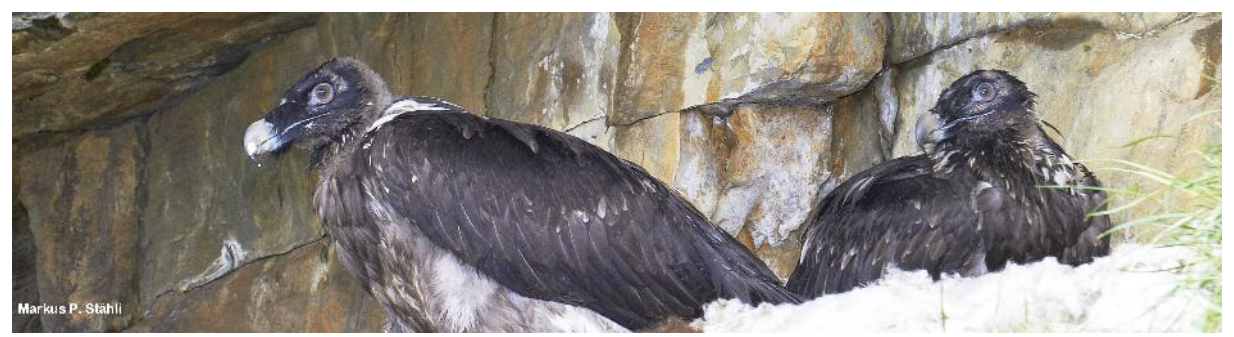
Young Bearded Vultures from the EEP just after their release in the Swiss Calfeisen Valley. Currently there are approximately 200 Bearded Vultures in the Alps. This reintroduction project represents one of the most successful wildlife comebacks in recent history, and is based on the successful work of the EEP.

So in total, in 2013 35 pairs laid a total of 56 eggs, which resulted in 19 surviving juveniles. 13 of these were released, and 4 were added to the breeding network (see Table 2 in Annex I – Offspring in 2013).