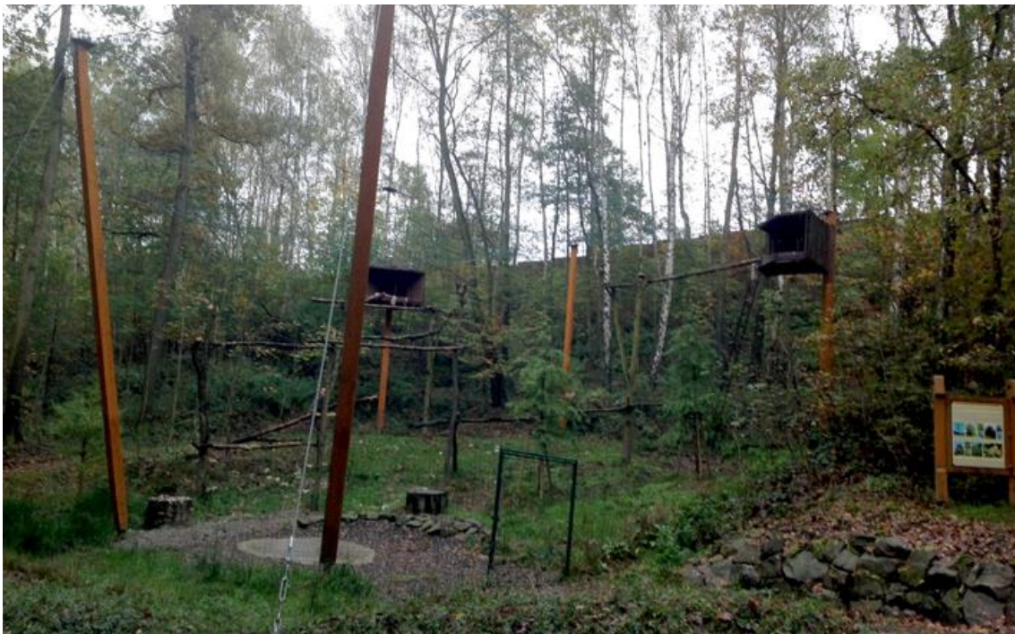
Picture 1: View from the entry. The huge Bearded Vulture facility has only wooden pillars for sustain the mesh.

The Bearded Vulture new facility is a huge almost square aviary. The welded elastic wire mesh is sustained by wooden pillars. The aviary is located in a forest area where visitors are normally not frequenting. The ground is a smooth slope covered with grass, and at its end by each corner-pillar there is a wooden cave as nesting site. By both wooden caves a fixed iron leader is installed to give the keepers the possibility by nest control to enter without introducing a hand leader. Near the entry there is a huge bath bowl, perfect for bathing and drinking (picture 1).