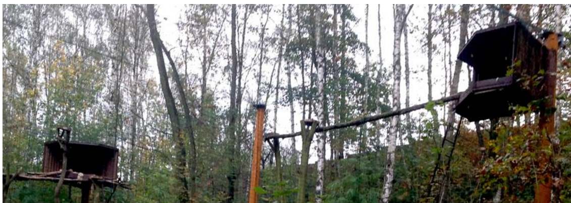
Picture 2: Two wooden caves are installed in opposite pillar corners. Both nests have a fixed iron leader.

diameter around 10-15cm- as perches. Furthermore several young firs are planted as environmental enrichment (picture 1).