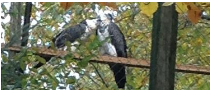
Picture 5: Mostly the female (left) started preening the male (right).

In the morning both birds were sitting very close at the edge of the nest. After preening itself, they spend almost the full day walking or sitting on the wooden plank (picture 4). There it could be observed frequently preening each other their feathers, during long periods. Mostly the female searched the male and started to preen him (picture 5).