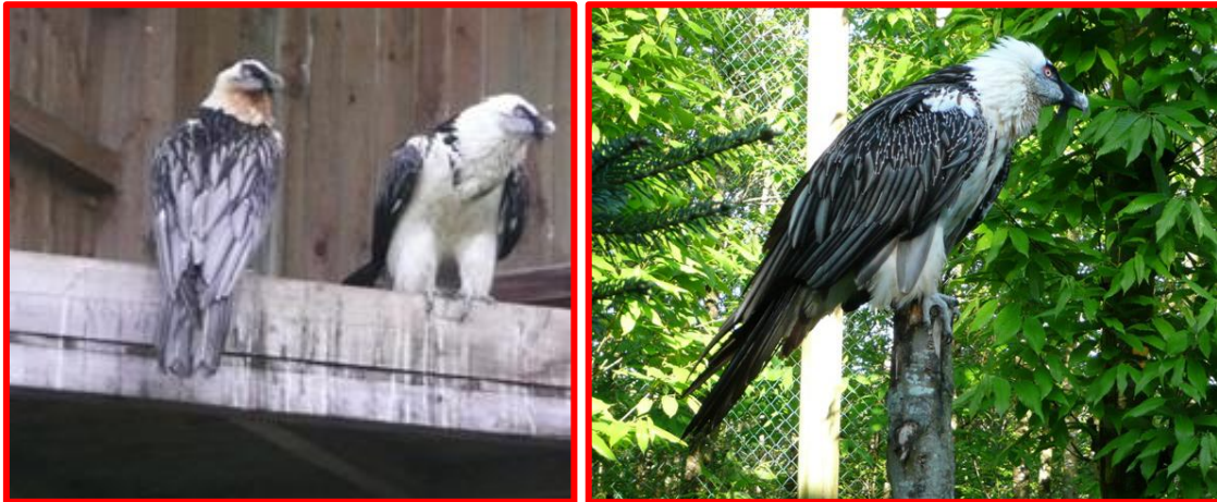
Picture 6-7: The surface of the edge of the nest and the pillars are too small for maintain the anatomical position of their talons.

Bearded Vultures as cliff breeders, the perches need to be adapted to suit the anatomy of their feet. The nest edge (wooden plank) as well the wooden pillars are too small for maintaining their balance on it. They must be big enough for giving the possibility to stretch completely their talons. We could observe in both places that the talons were completely closed for maintaining their balance (picture 6-7) completely against as they usually do. Only at the board perch the birds can copulate without losing their balance.