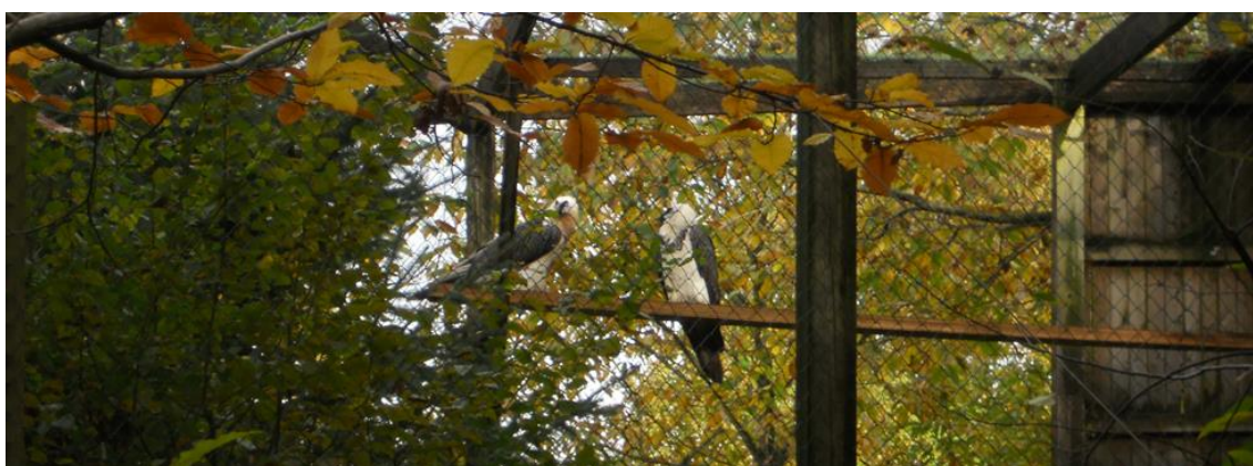
Picture 4: One wooden plank has been installed from the nest edge to the second pillar.

Only one board has been installed from the nest edge to the second wooden pillar as a perch. The board has the thickness and is wide enough to be sufficient rigid to prevent them from bending during copulation on the perch (picture 4).