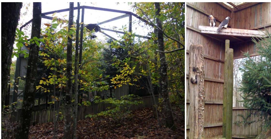
Picture 1-2: Bearded Vulture aviary located middle of a forest with several firs inside. Pillars from different sizes are installed for climbing up to the nest.

Is a huge aviary built in the middle of a forest with several trees (almost firs) as environmental enrichment (picture 1). Wooden pillars (12-14cm diameter) from different sizes are installed as steps for climbing up to the nest (picture 2).